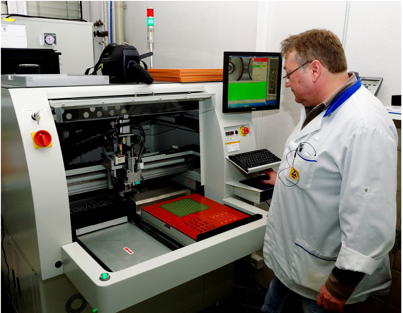
ESCATEC's Elite EM-5700N PCB Router

Heerbrugg, Switzerland – 29 April 2014 – ESCATEC, one of Europe's leading contract design and manufacturing companies, has installed an Elite EM-5700N PCB Separator. This milling machine enables PCBs to be automatically separated from each other after production. The camera vision system provides a cutting accuracy of 100 microns providing customers with a very high quality of PCB finish.