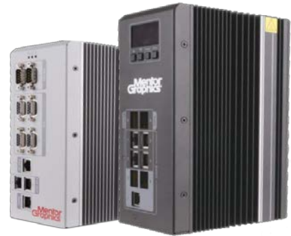
Smart IOT BOX